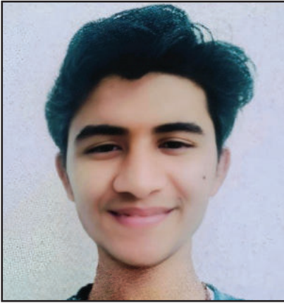
Pranav Jagtap Balaji Law College Pune