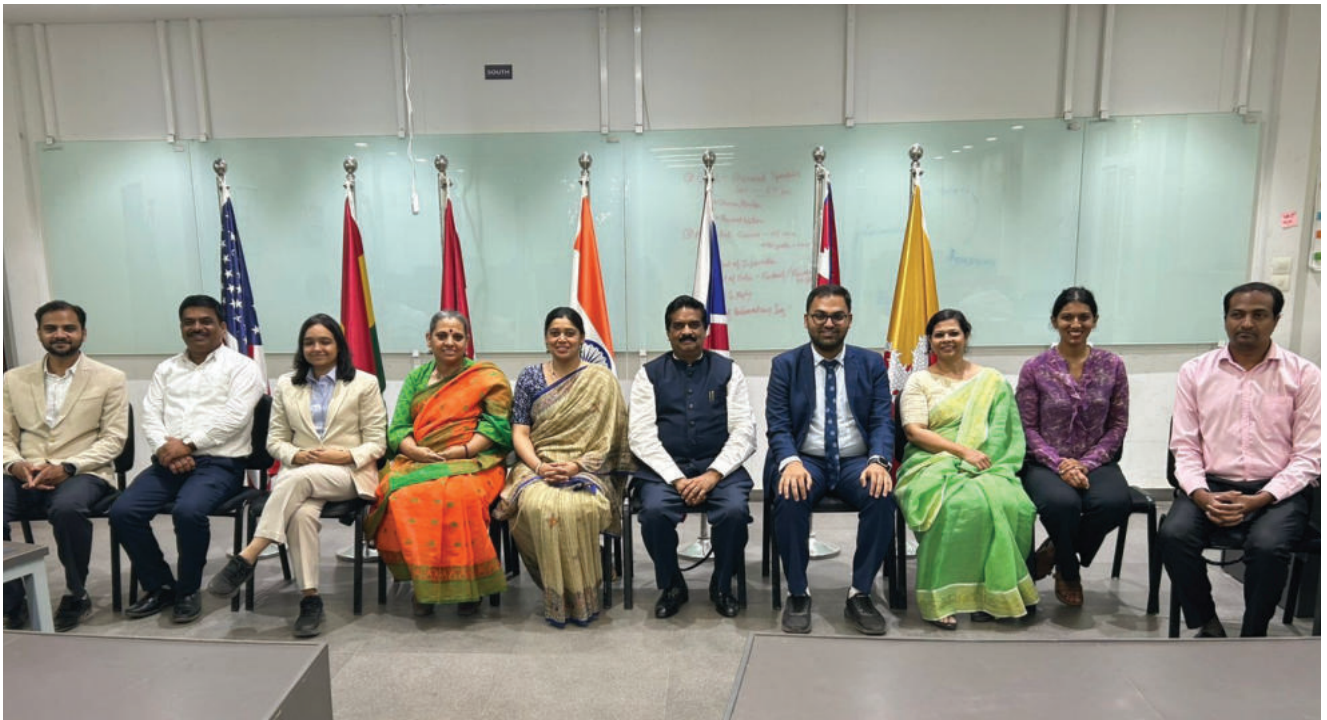
The team behind the successful Foreign Policy Awareness Programme .

Finally, we thank all participants for their enthusiastic engagement and meaningful contributions, which added depth and value to the discussions and activities.